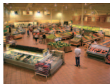
2nd Streaming VGA video of a cropped area